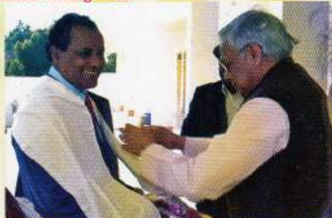
Hon'ble Chairman HVP B.Ed. College honouring N.C.T.E. Inspection Team Member