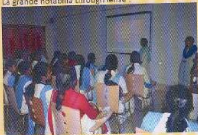
ICT Resource Centre