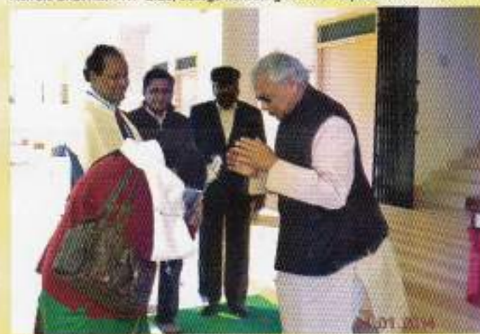
Hon'ble Chairman HVP B.Ed. College with N.C.T.E. Inspection Team & others