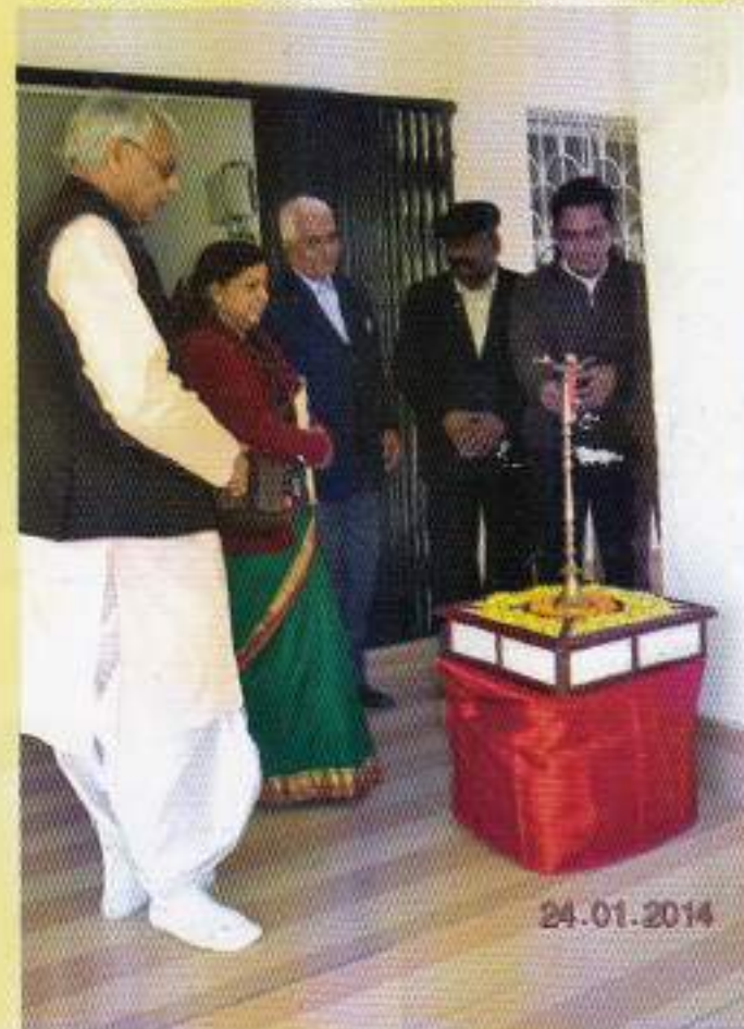
Hon'ble Chairman, HVP B.Ed. College Managing Committee Member & N.C.T.E. Inspection Team are engrossed with Inauguration Ceremony