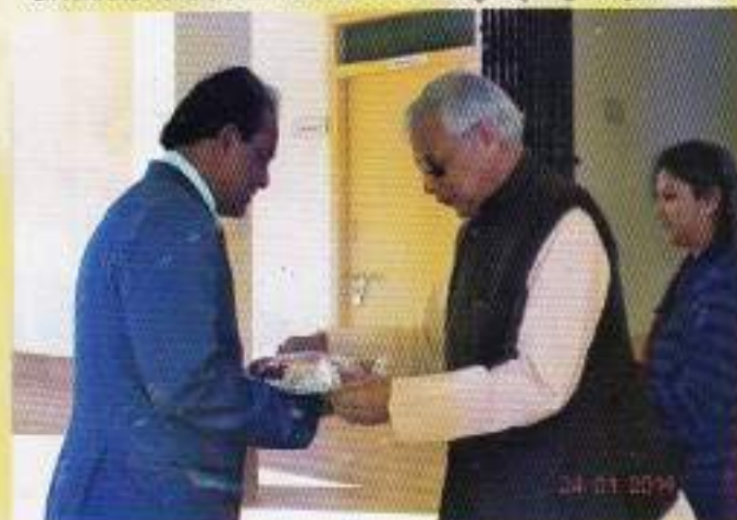
Hon'ble Chairman HVP B.Ed. College greeting the N.C.T.E. Inspection Team Member