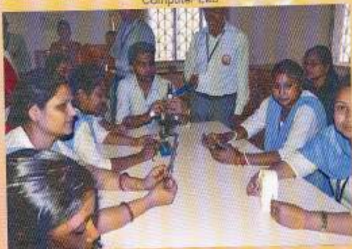
Science & Mathematics Resource Centre